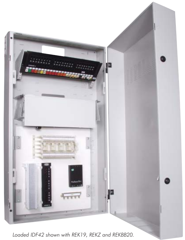
Loaded IDF42 shown with REK19, REKZ and REKBB20.

The RE-BOX® commercial cabinets are specifically designed for housing remote network equipment. RE-BOX® commercial cabinets exceed the stringent requirements of UL and Telcordia™ enclosure standards. The resulting safe and secure environment surpasses the industry for protecting communications equipment in locations such as classrooms, warehouses, and retail outlets.