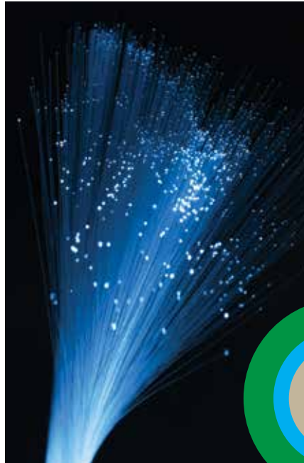
Buffered Fiber Cross Section