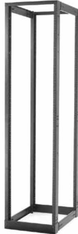
4-Post Rack Recommended for mounting servers