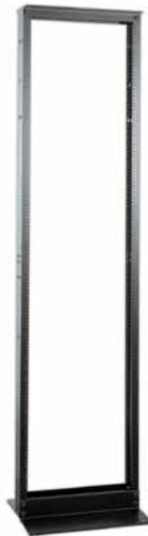
3" Deep Rack Recommended for Cat 5e/6 cables