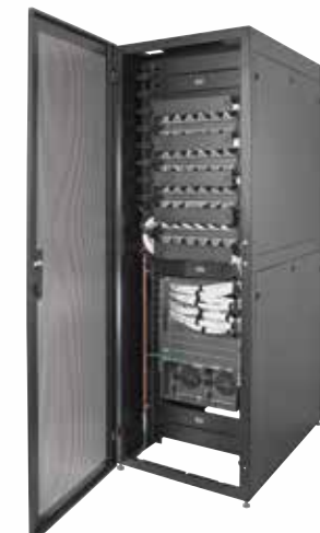
Full Size Enclosure