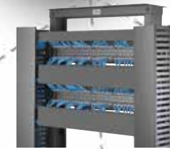
SD Series Cable Manager