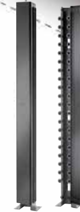
iFRAME Cable Management