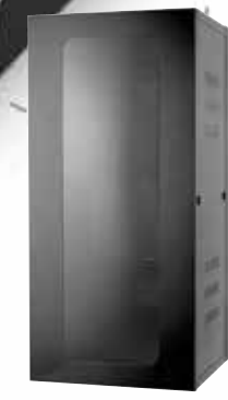
QUADCAB® Wall Mount Cabinet