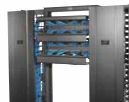
M Series Cable Manager