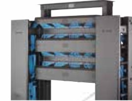
S Series Cable Manager