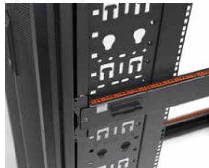
Vertical cable management bar, easy to align vertical rails