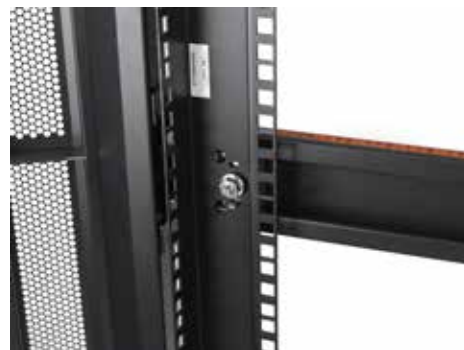
Loosen nut to adjust rail depth position