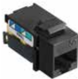
Snap Fit Jack NSJ5EBK

xx = Color: BK (Black), B (Blue), GY (Gray), GN (Green), I (Ivory), LA (Light Almond), OR (Orange), R (Red), W (White) and Y (Yellow) *Available in BK, B, LA, OR and W only.